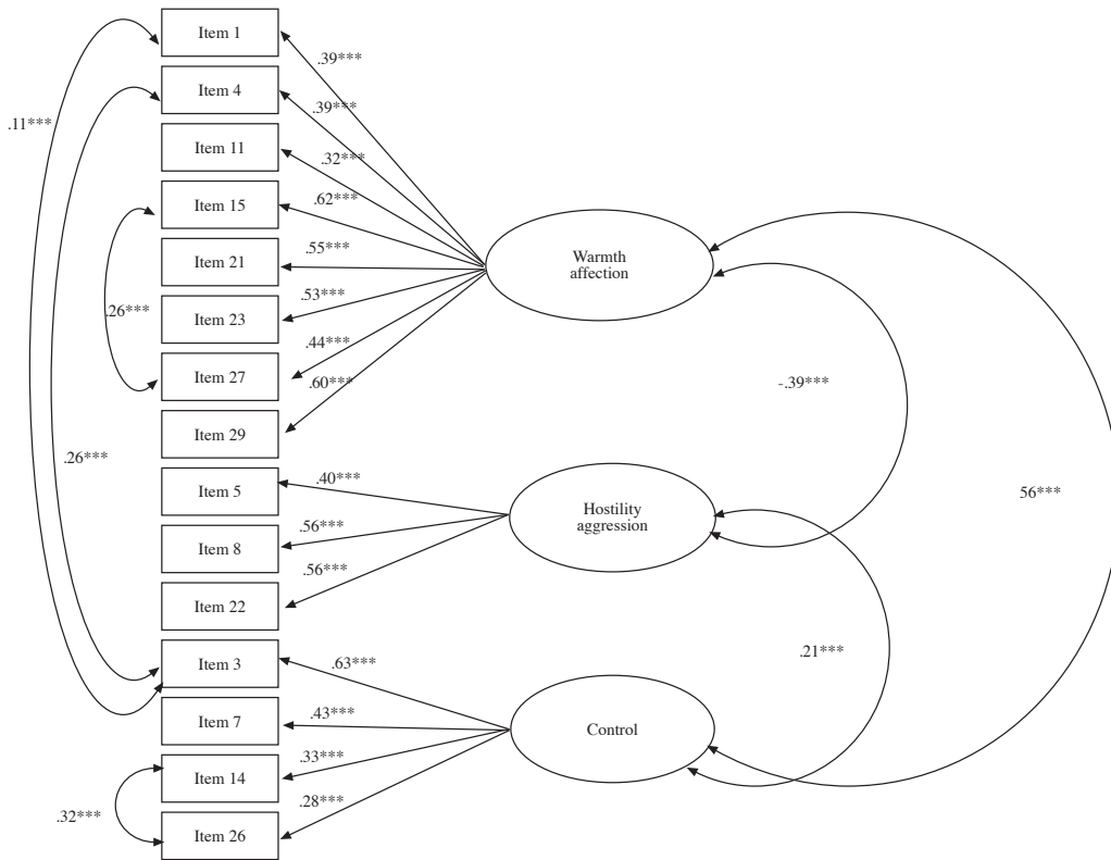
Figure 1. Confirmatory factor analysis. Parent PARQ/Control. Mothers' version. Short Form. Note: n_{AFC1} = 706 ; n_{AFC2} = 752 * p < .05 ; ** p < .01 ; *** p < .001